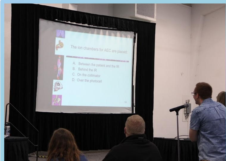
Then the Student bowl excitement started to set in...